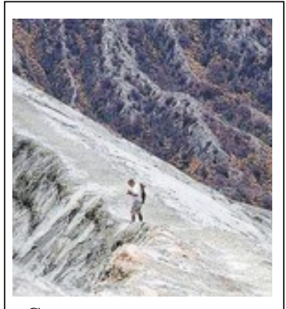
C. A tourist stands at the top of the crater on the Bromo volcano East Java 8/06/04.

Example: The man on the volcano must have been crazy to go so near it.