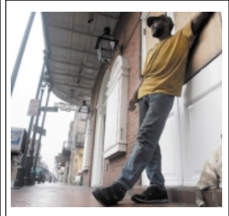
B. A homeless man stands in New Orleans before the arrival of Hurricane Katrina on August 28, 2005.